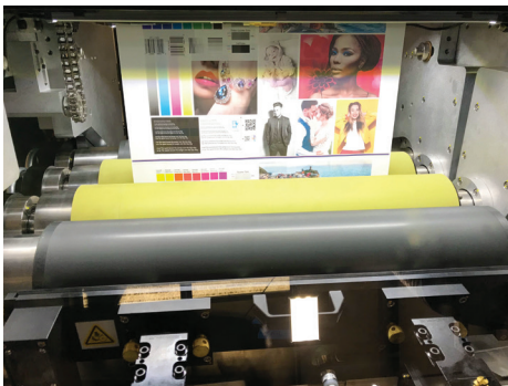
Duplex Chamber/Anilox Coating Station

Warranty 1 year (includes Remote Support System)