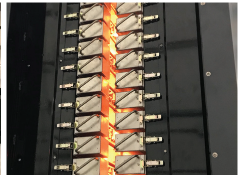
AQ Drying Unit with Toolless Cassette Removal for Maintenance